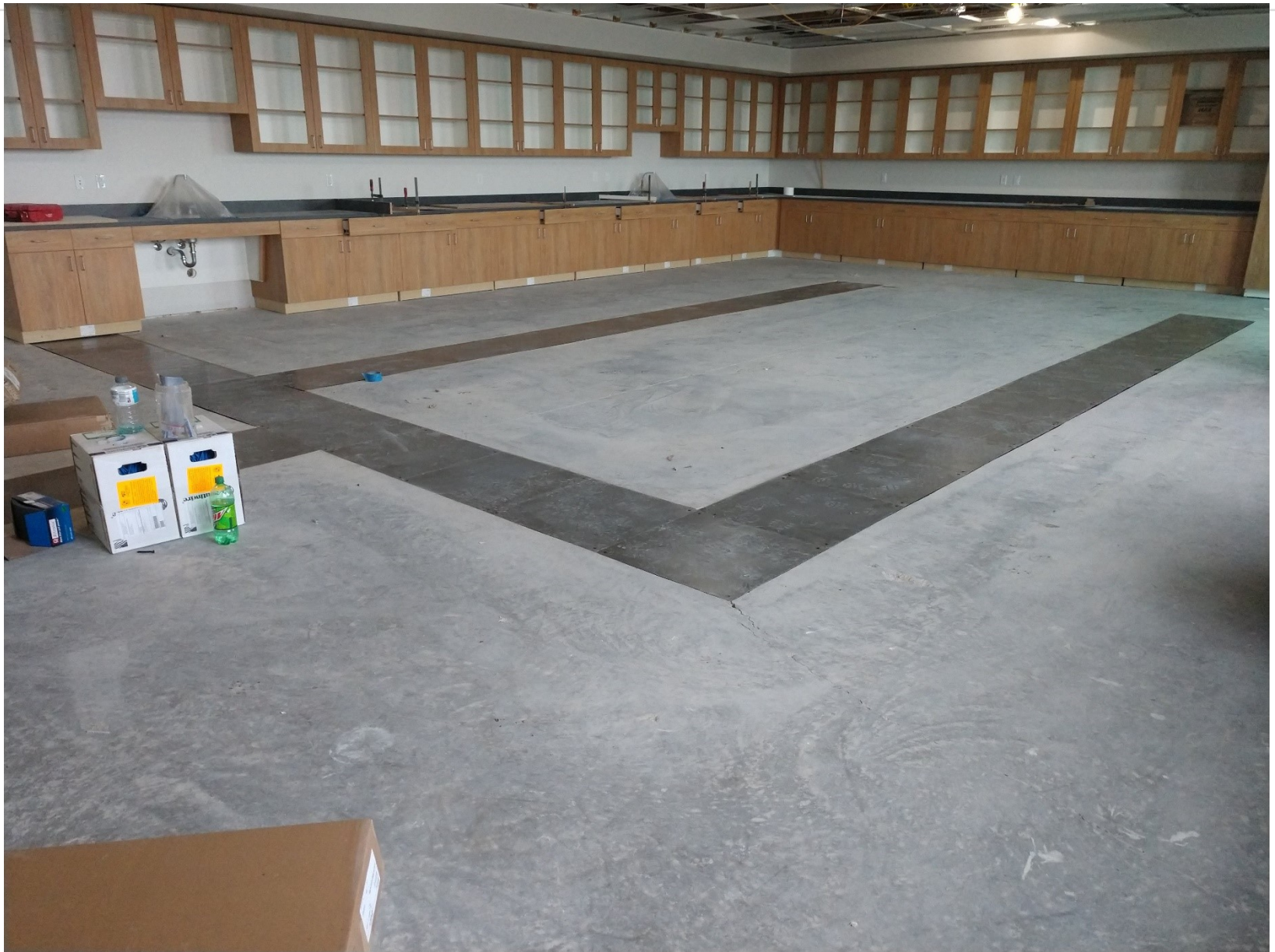
Science classroom with cabinets and removable floor chase